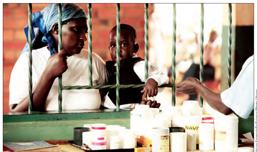
Figure 6: Dispensary staff are key in providing access to antibiotics, but also have a role in preventing excess

An effective new diagnostic test for bacterial acute lower respiratory infections could save at least 405 000 children's