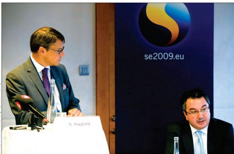
Figure 7: The Swedish Government, particularly Minister of Health Goran Hagglund, have helped define the problem of antibiotic resistance thus far

The infrastructure of antibiotic discovery in academia and the pharmaceutical industry has fallen to a dangerously low level. A prolonged loss of skills in both sectors means few people have experience of antibiotic discovery, especially of new classes. If a university or a company has no people engaged in antibiotic discovery, it is unlikely to produce new ideas in this area.