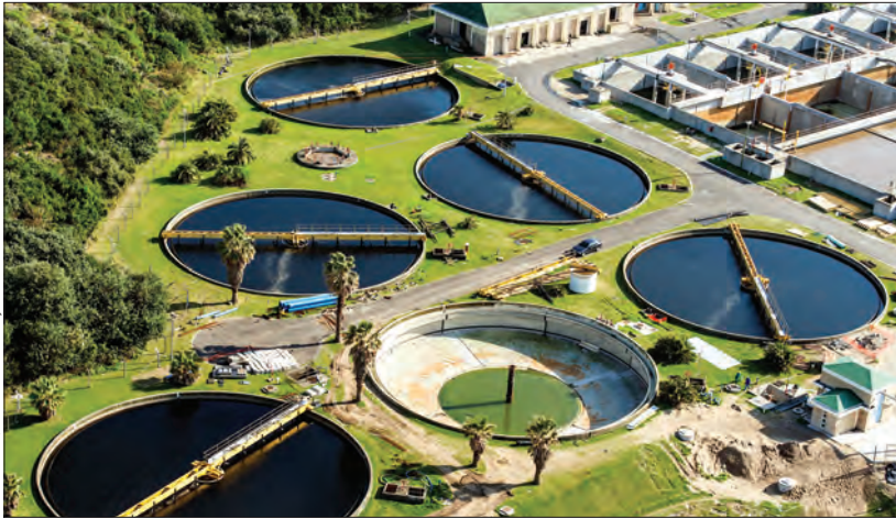
Figure 3: Waste-water treatment facilities can be hotspots for horizontal transfer of resistance

Quality-assured basic microbiology services and routine bacterial resistance surveillance are urgently needed in most of these areas. Positive experiences in high-income settings, such as Europe, 117 with its easy-to-understand, interactive, and yearly updated data, could inspire policy makers in other regions. The addition of antibiotic resistance to death registers might help to raise awareness of antibiotic resistance on the priority agenda of policy makers.