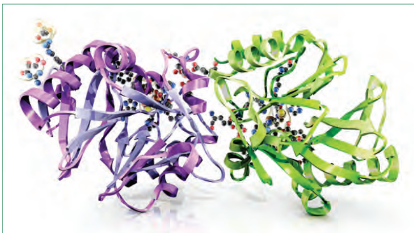
Figure 8: Potential targets of new drugs include resistance enzymes such as ESBLs

Among the more promising antivirulence targets are quorum sensing, type 3 secretion systems, toxins, and the biosynthesis of glycolipid surface structures. Quorum sensing refers to the production of diffusible small molecules by bacteria that act as autoinducers of various cellular factors at high cell densities. These compounds, such as homoserine lactones produced by Gram-negative