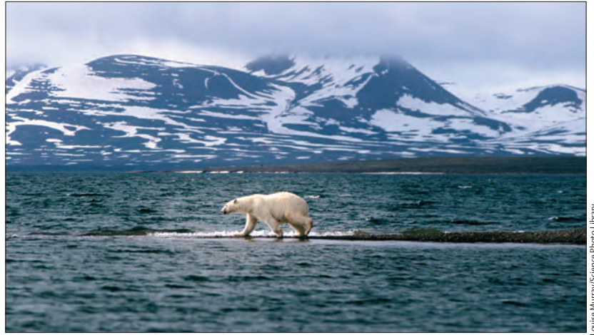
Figure 2: Antibiotic resistance in nature, such as that identified in polar bears in Svalbard, is likely anthropogenic

In the non-medical arenas of agriculture, aquaculture, and intensive farming, huge amounts of antibiotics are used in some countries—up to four-times the amount used in human medicine. 75 There is little separation of the types of antibiotic used in human beings and animals.