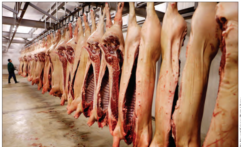
Figure 5: High standards of food processing can prevent contamination of food with bacteria

The detection of vancomycin-resistant enterococci with the vanA -gene cluster in animals in the EU triggered