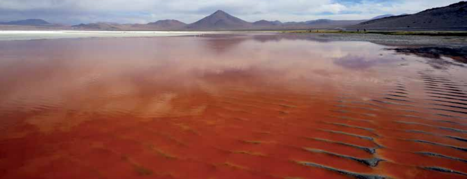
Laguna Colorada in Peru. The water is colored red by microbes/microorganisms.

The most influential bacteria for life on Earth are found in the soil, sediments and seas.